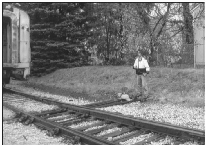
A soggy switchman tends to his duties at the end of the day.