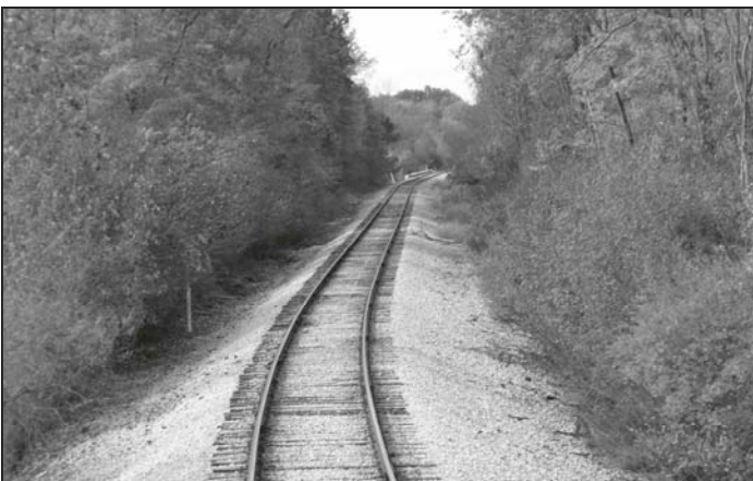
The view from the Fireman's seat on the Fall Foliage Trip.

Once everyone was back on board, we continued eastward to Spencer and then headed south from the junction back home to Orrville.