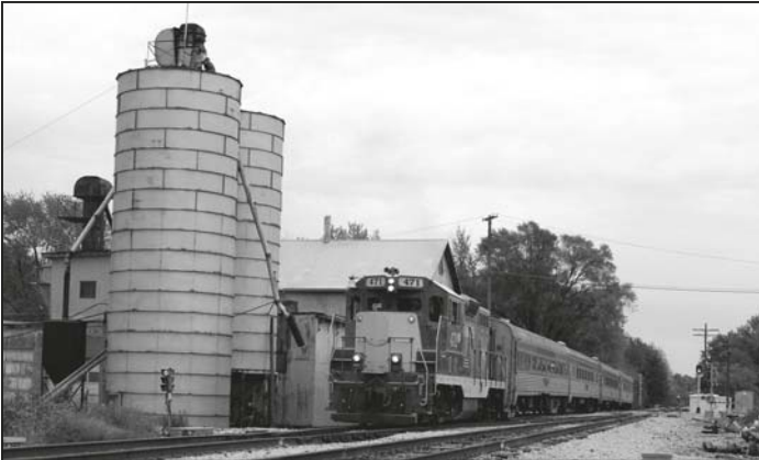
Running through the junction at Spencer to return to Orrville.