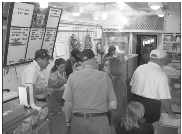
The 105 Concession Car crew serves its customers on ORHS excursions.

Here's hoping we have continued success in 2013 and I wish everyone the best!