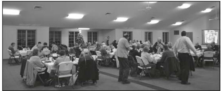
Food and conversation were the main topics at the Annual Membership Dinner.

ORHS held its Annual Membership Dinner on Tuesday, December 4 at the White's Maibach Ford Community Room in Orrville. Over 60 attendees enjoyed great food and camaraderie during the evening.