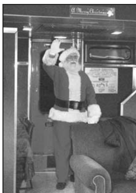
Santa arrives to greet the children in the 3125 during "Riding With Santa".

eral displays of railroadians including train models and uniforms. The Gift Shop in the depot was open with railroad gifts for early Christmas shoppers.