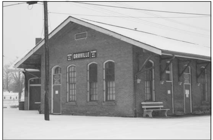
Orrville Union Depot awaits the coming of spring and the events planned for 2013.