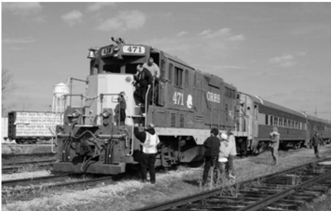
Visiting #471 at the Jumpin' Pumpkin Jamboree

The classes will be presented and discussed at our regular meetings, as well as at the Executive Committee meetings..