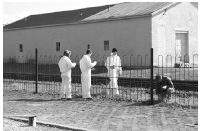
Boy Scout volunteers painting the ORHS Depot fence.

Like my mother, she was a great lady and will be missed by everyone.