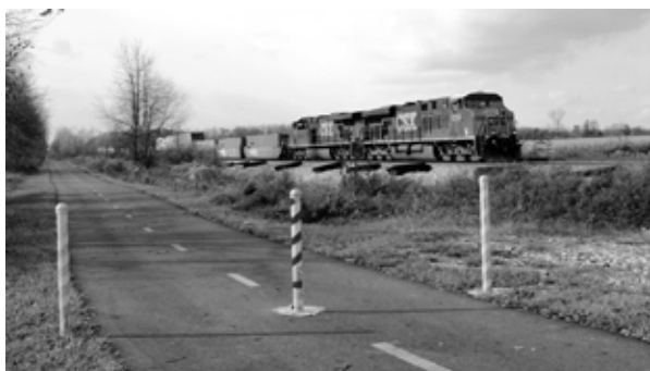
County Line Trail