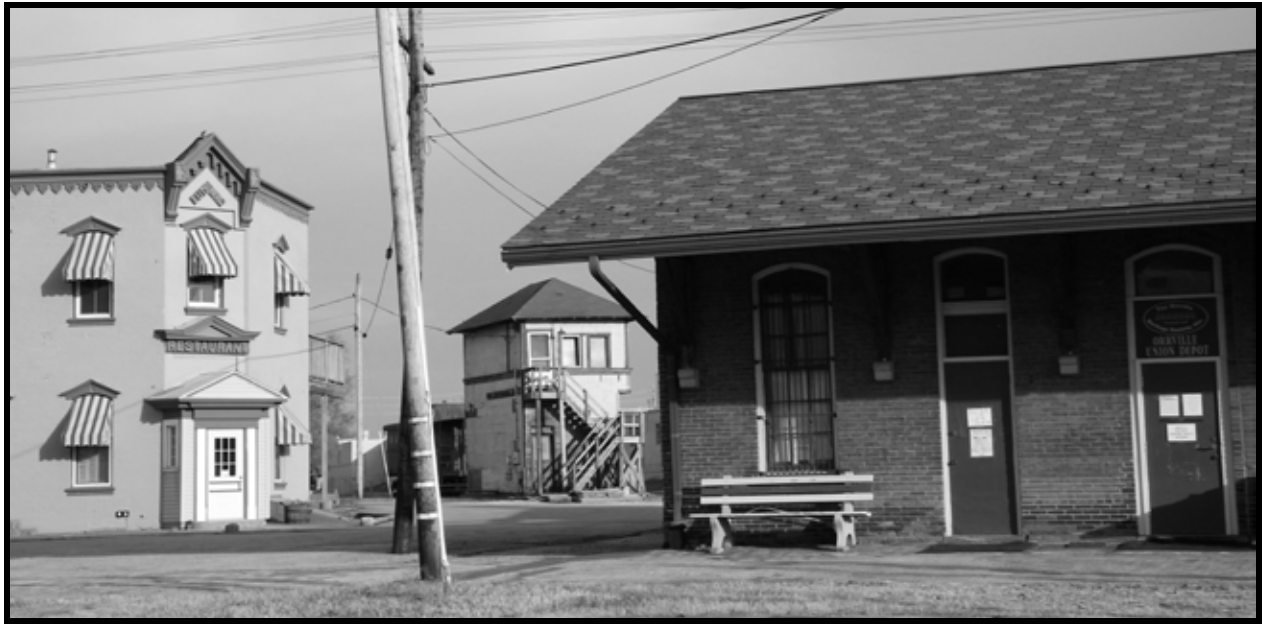
The ORHS former Pennsylvania Railroad 1868 Depot Museum and Tower are honored to be listed on the National Register of Historic Places, as part of the Orrville Downtown Historic District.