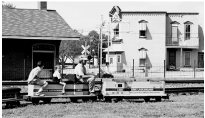
The model trains were fun too at Railroad Day on August 13.