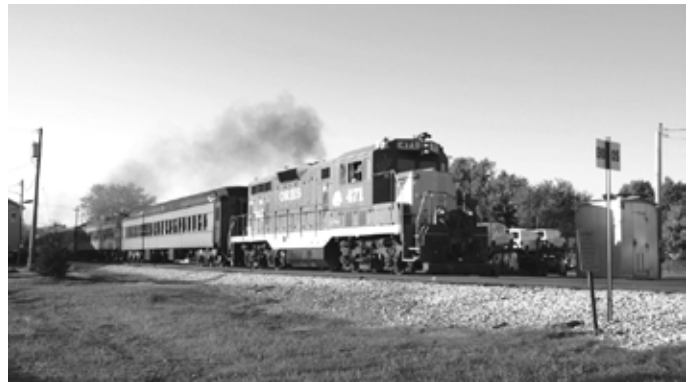
The "Fall Foliage Circle Trip" speeds through Creston on its way home to Orrville on October 8th.

The Orrville Union Depot Museum will also be open from Noon to 6 PM on Saturdays November 19, 26 and December 3 for the Holiday Open House festivities.