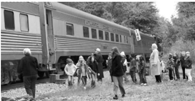
Highland District students board the OLS train on 10/15/09

Please remember to always " Look, Listen, and Live " when you come to railroad grade crossings.