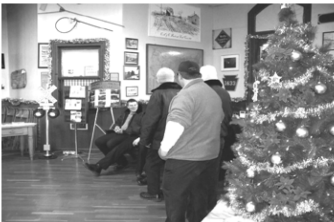
The parking attendants enjoy the holiday ambiance in the ORHS 1868 depot at the 12/5 Christmas Open House.