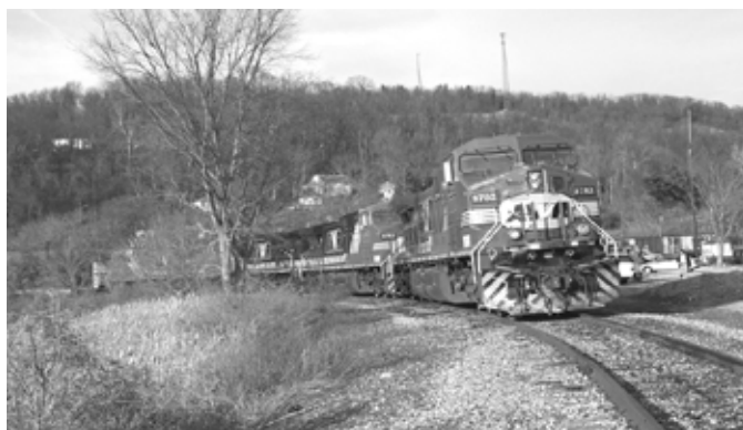
The locomotives used in the movie production reside in the Warrenton railroad yard on 11/29/09.