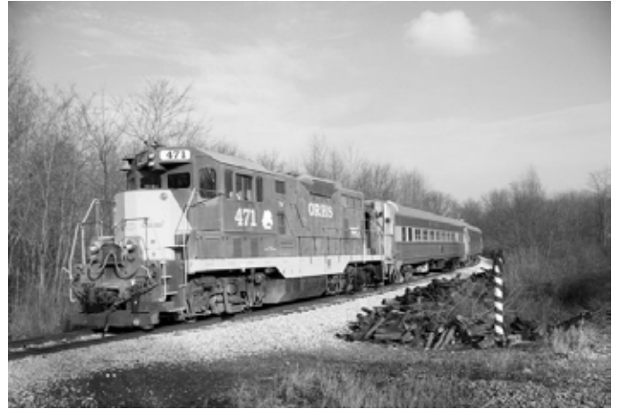
ORHS #471 leads the "Riding With Santa train from the branch onto the W&LE mainline at Orrville Junction on 12/5/09.