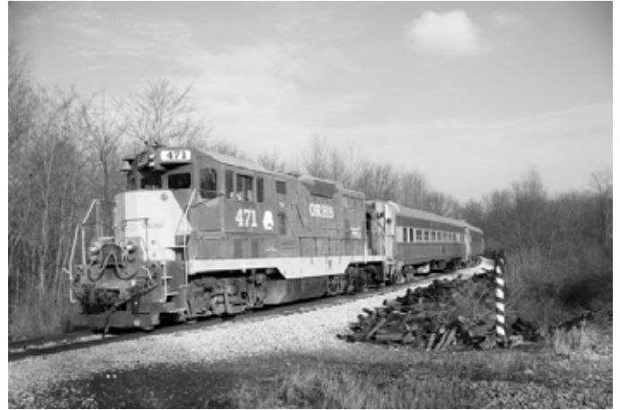
ORHS #471 leads the "Riding With Santa train from the branch onto the W&LE mainline at Orrville Junction on 12/5/09.